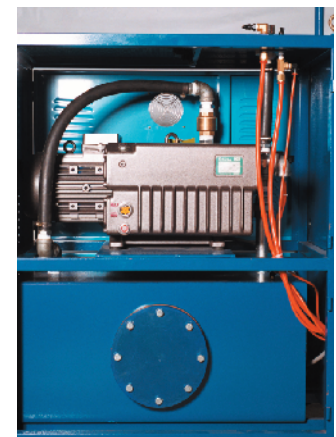
真空機內部 Vacuum machine interior